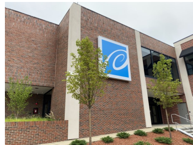
Pennichuck's New Headquarters

In November 2020, we moved to our new headquarters in Nashua! Our new address is 25 Walnut Street, Nashua, NH 03060. Be sure to check out our website at www.pennichuck.com for updates on when the front office is open to the public. For your convenience, there is a drop box located to the left of the main entrance.