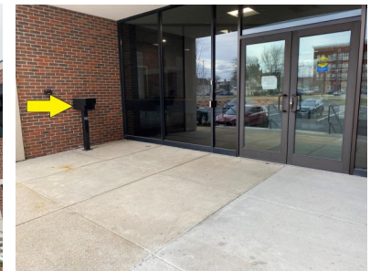
Drop Box, Left of Main Entrance